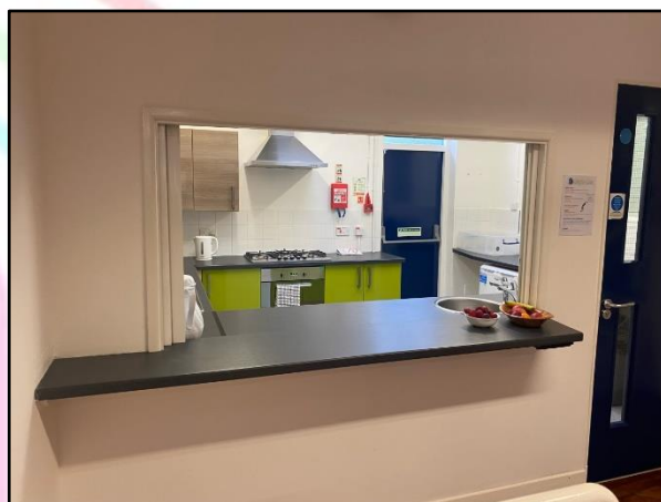
This is the kitchen