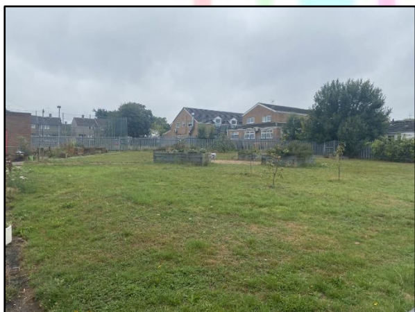
This is the outside area