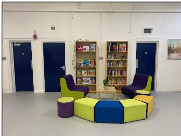
These are the toilets