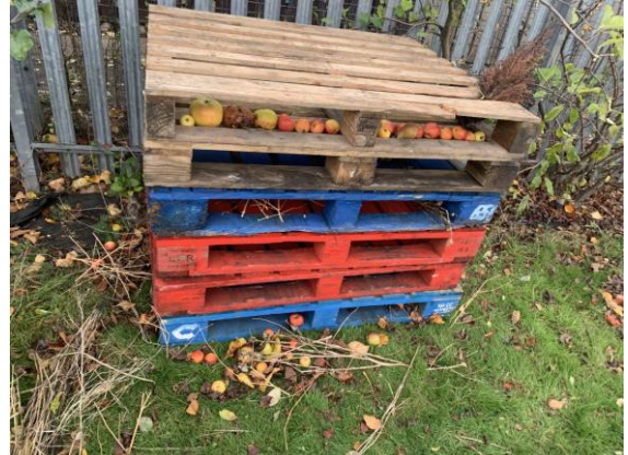
Beginning to build a winter home for our little visitors 🐛🐜